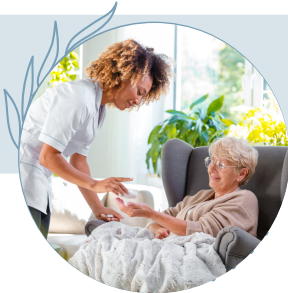
Prompting or giving medicine