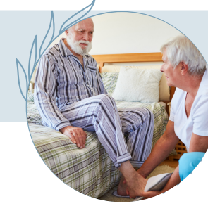
Going to bed, getting up and personal care