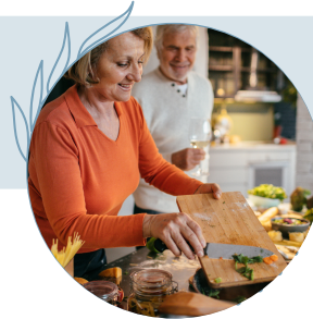
Preparing meals and helping during mealtimes