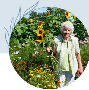
Social activities or hobbies