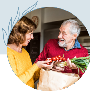
We assist with housework, laundry and shopping